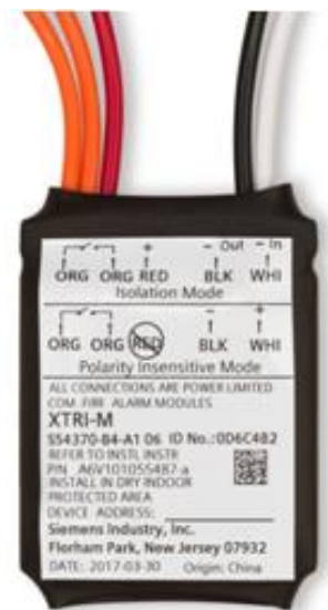
Model XTRI-M Mini Interface Module

The XTRI-M module has five (5) flying leads which are wired with user-supplied wire nuts for connection to an addressable circuit with a compatible Siemens FACP.