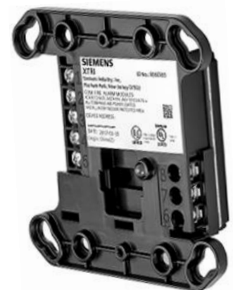
Model XTRI-D | XTRI-R | XTRI-S Intelligent Device Interface Module

This single-input interface module can only monitor and report the status of a N.O. or N.C. contact.